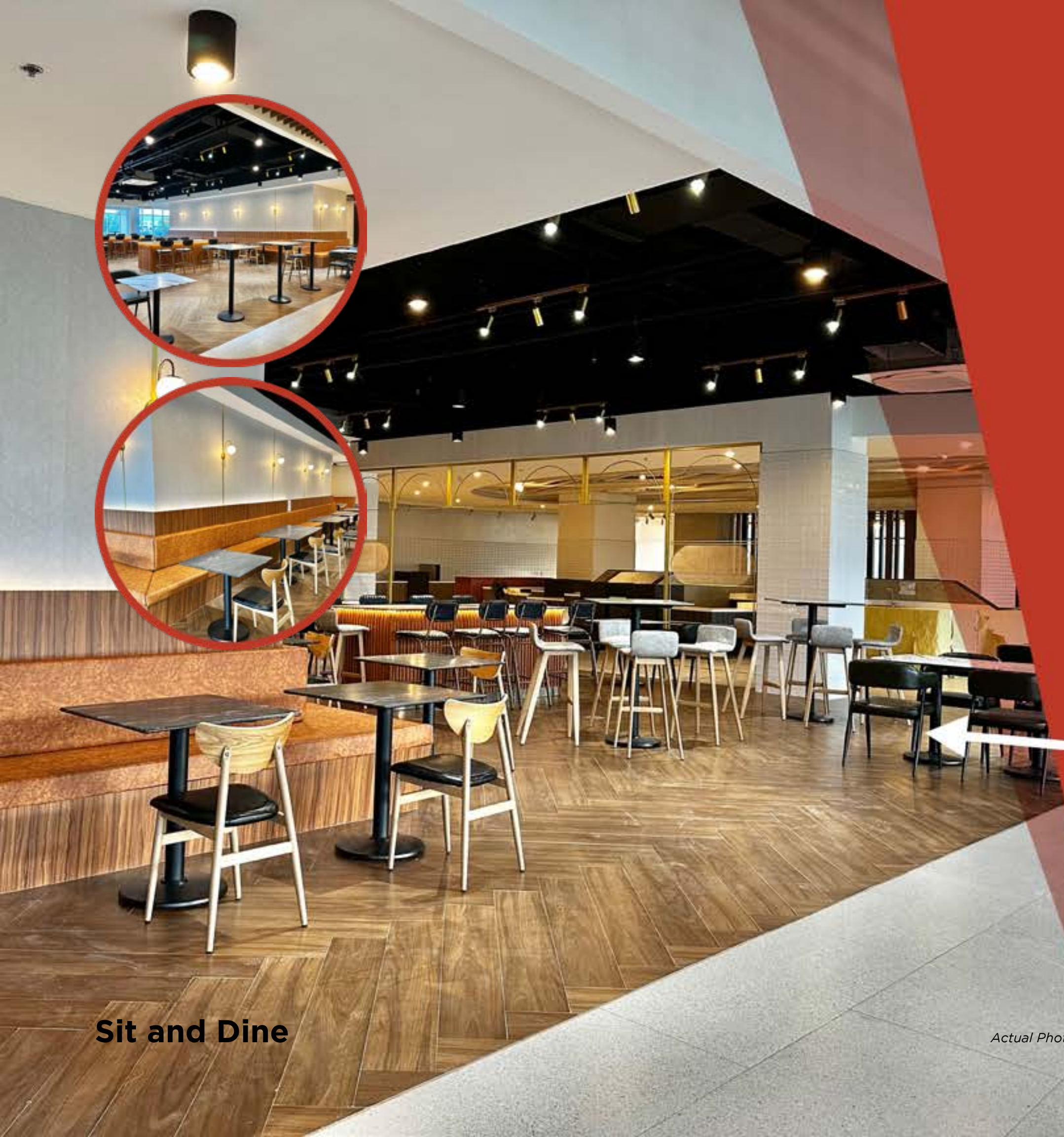
Sit and Dine