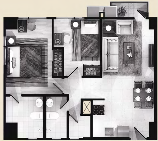
2-bedroom Unit 41.80 - 59.70 sq. m.