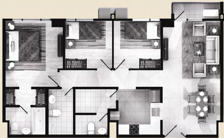
3-bedroom Unit 85.44 - 91.62 sq. m.