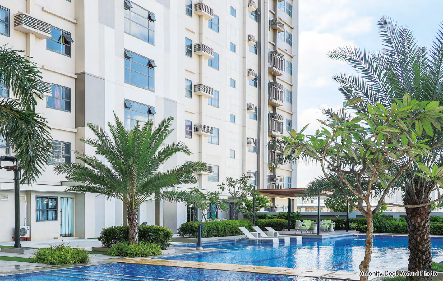
Amenity Deck Actual Photo