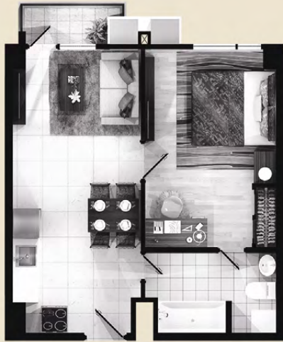
1-bedroom Unit 30.10 - 32.65 sq. m.