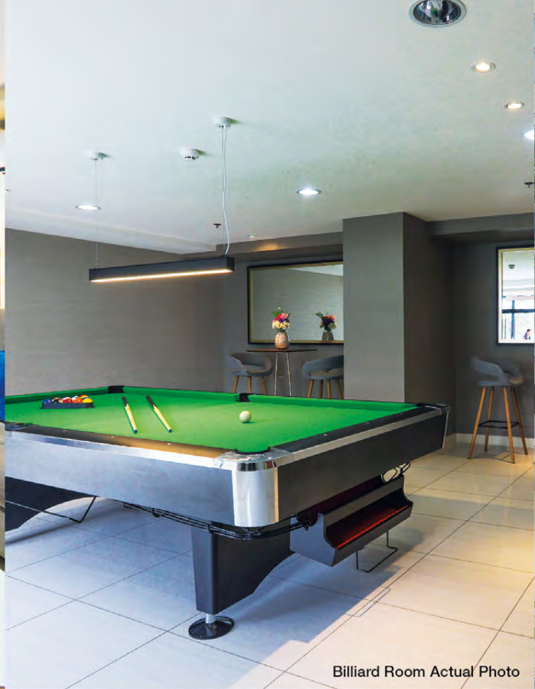
Billiard Room Actual Photo

Horizons 101 is an iconic landmark that commands a high demand for homes, rentals, and staycations by those who wish to see Cebu from the city's tallest condominium. Both Tower 1 and 2 are now ready for occupancy and are serviced by a world-class property management company. This means that your investment in Horizons 101 can give you prompt returns, whether that may be from renting out your property or from the intangible feeling of prestige conjured by living in an awe-inspiring address.