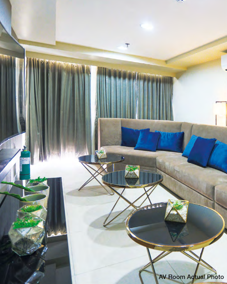
AV Room Actual Photo