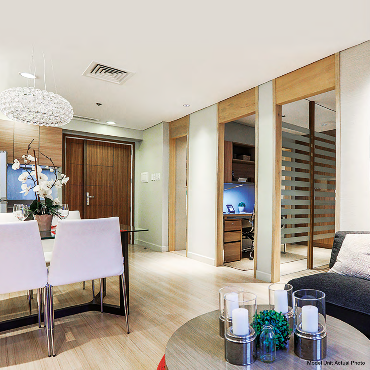
Model Unit Actual Photo